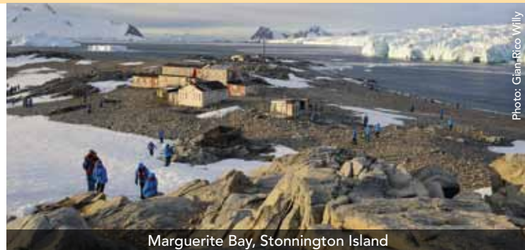
Marguerite Bay, Stonnington Island