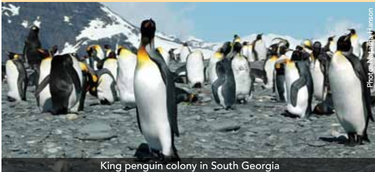
King penguin colony in South Georgia

Paradise Harbour The harbour is paradise not only in name but in splendour and scenery as well. Protected from the winds of the nearby Gerlache Strait, Paradise Harbour offers another rare opportunity for a